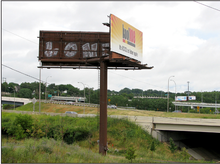
Billboards are often the target of graffiti artists.

This example is near Interstate 94 and the Bruce Vento Nature Sanctuary.