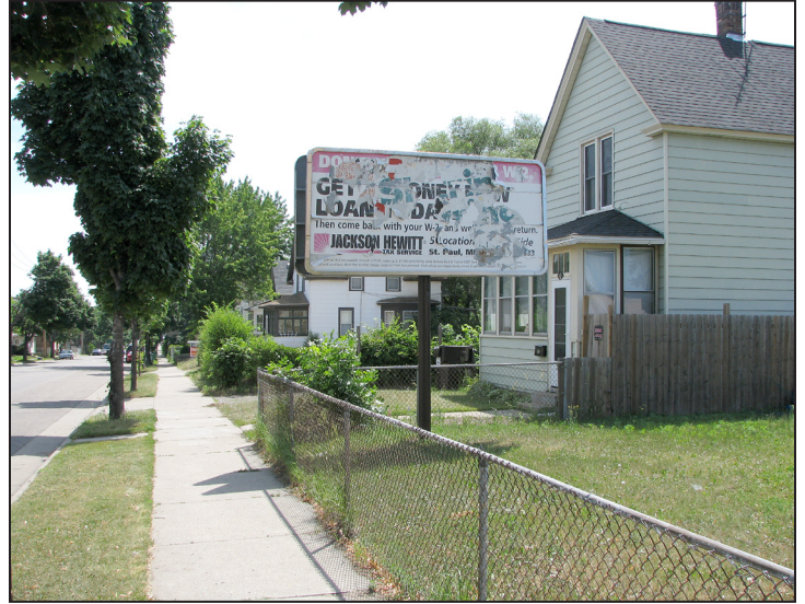
An old billboard that should have been taken down long ago.

This example is near Interstate 94 and the Bruce Vento Nature Sanctuary.